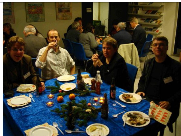
Networking disguised as Danish-style Christmas lunch