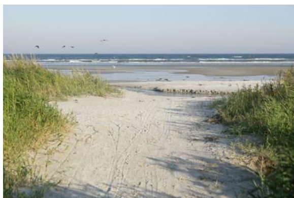
North Jutland in June, as seen by VisitNordjylland

The aim of the RSA research network on tourism, regional development and public policy is to examine tourism diversity from the perspective of regional development in order to identify current challenges and opportunities in a more systematic manner, and hence provide the basis for a more well-informed integration of tourism in regional development strategies and move beyond political short-termism and buzzword fascination. This aim is pursued through a series of workshops and publications, taking place in 2008-2009, starting in Izmir, Turkey, spring 2008, and the third meeting taking place in Warsaw, Poland, in September 2009. In between southern charm and metropolitan buzz, the second workshop took place in Aalborg, Denmark, where, shrouded in the darkness of northern November, 25 participants from all over Europe gather to discuss issues related to tourism and regional development.